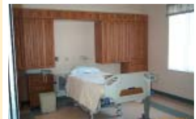
The recovery phase of care. Technology is hidden.