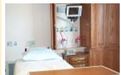
The ICU phase of care.

Call our office at 412-364-8200 to speak with one of our experts on CUB development.