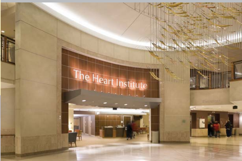
St. Joseph Medical Center Architecture by CSD Architects and Gresham Smith & Partners.

Corazon worked with the St. Joe's team on both the design and implementation of this 'heart hospital within a hospital' and has placed an Interim Manager there to oversee the Cardiographics. The Heart Institute at St. Joseph is Maryland's busiest and premier heart center, providing advanced cardiac care. It has been recognized eight times—more than any other Maryland hospital—as one of the top 100 heart centers in the country by Thomson Reuters. Corazon congratulates St. Joe's on their new facility, and wishes the team success in the future!