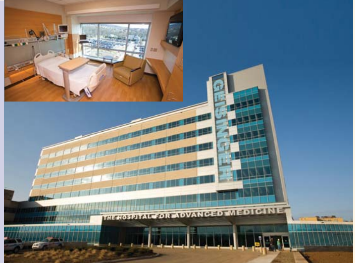
Geisinger's $100 million state-of-the-art facility, The Hospital for Advanced Medicine. The new facility design is accompanied by an innovative patient care model that will streamline operations by improving efficiencies and decreasing resource utilization. The HfAM uses an acuity-adaptable model of care. Inset photo shows their "universal bed" patient room.

BPTW in Western Pennsylvania , ranked #44 overall and #30 among firms with fewer than 50 employees; BPTW in Pennsylvania , ranked #24 overall, appearing on this list three of the last four years, with the 2009 ranking as the highest; BPTW in Healthcare , ranked #88 overall of the 100 organizations on the list, and ranked #10 among organizations with fewer than 100 employees.